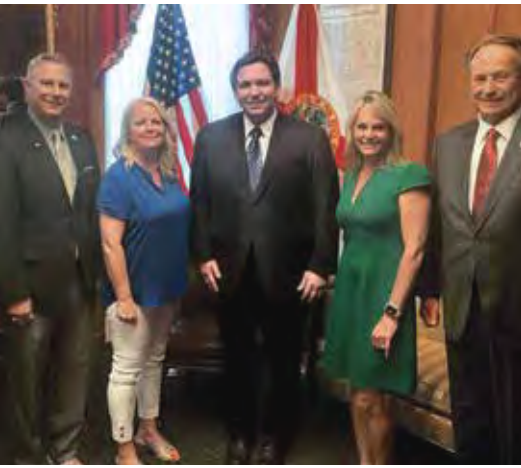
AMAC Action and AMAC leadership with Florida Governor Ron DeSantis