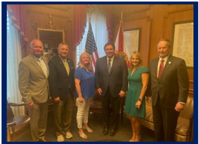
AMAC and AMAC Action Leadership with Florida Governor Ron DeSantis in his office in Tallahassee